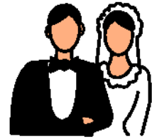
bride and groom

Wedding promises are sometimes called vows.