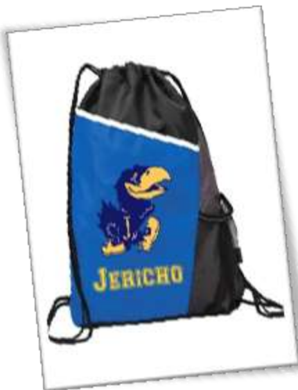
Jericho SEPTA fundraiser Backpack.